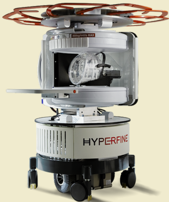
Portable Pediatric MRI Machine purchased in 2023

Synergy 8 Community Builders embraces the spirit of collaboration with local community groups and organizations. Our central mission is to provide strong leadership in community engagement while pioneering innovative strategies that foster and elevate sustainable community development.