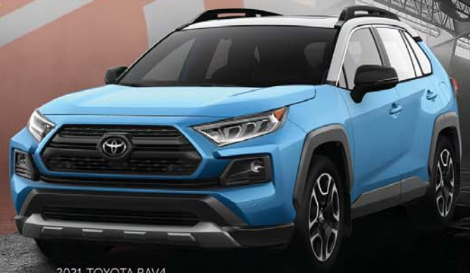
2021 TOYOTA RAV4