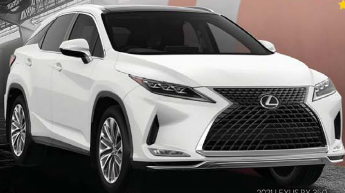
2021 LEXUS RX 350